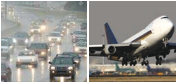
Suitable for a range of applications.

Airports need to monitor visibility across the airfield to ensure the safety of taxiing aircraft, for Runway Visual Range (RVR) calculation and for transmission to aircraft as part of the METAR. The SWS-200 can fulfil all of these roles and also provides present weather information for inclusion in METAR reports.