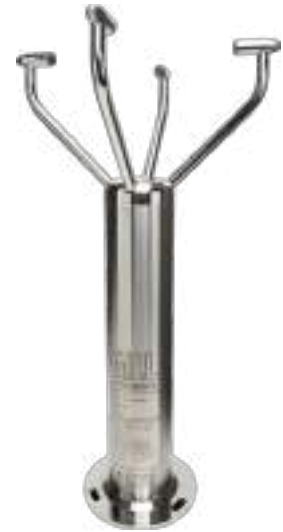
WindObserver IS intrinsically safe anemometer.