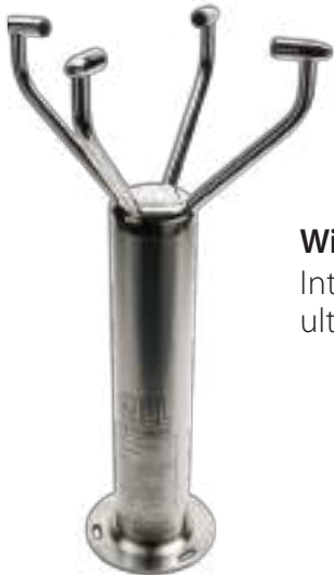
WindObserver IS Intrinsically safe ultrasonic anemometer