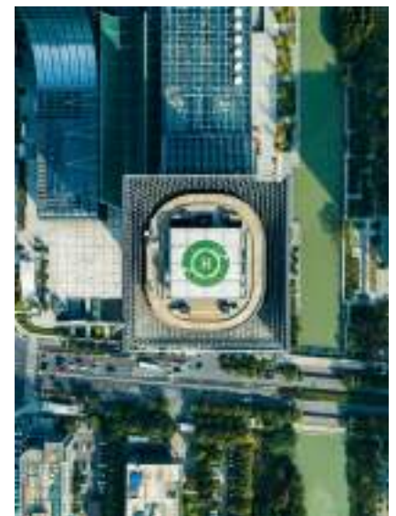
WindObserver IS is designed for use in potentially explosive atmospheres.