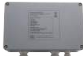
Low Voltage (DC) Power & Commu- nications Interface (LVPCI)

(Mains power adaptor option also available - see page 5)