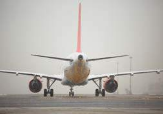
Designed for aviation, roads, research and general meteorological use.

range of 10m to 40km, and atmospheric Extinction Coefficient (EXCO). The features, accuracy and resolution of the SWS-050 ensure it complies with ICAO and WMO specifications for aviation use including use in instrumented Runway Visual Range (RVR) systems.