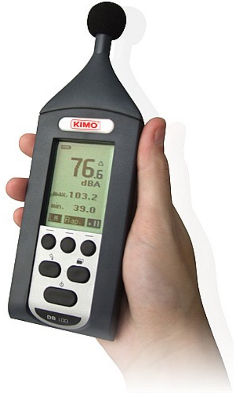
*Livré avec écran anti-vent