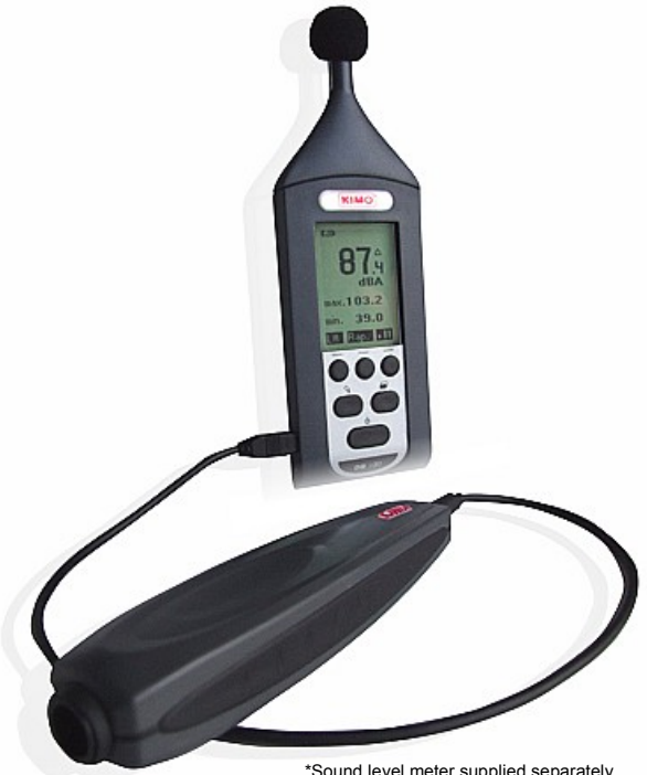
*Sound level meter supplied separately