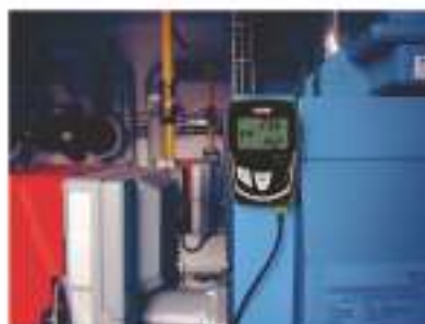
Selective controls of temperature