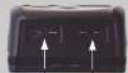
Connectors for thermocouples