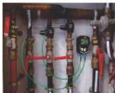
To prevent legionnaire's disease : check of hot water sanitary network