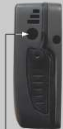
Jack connector (3.5) Input for Kistock-PC software